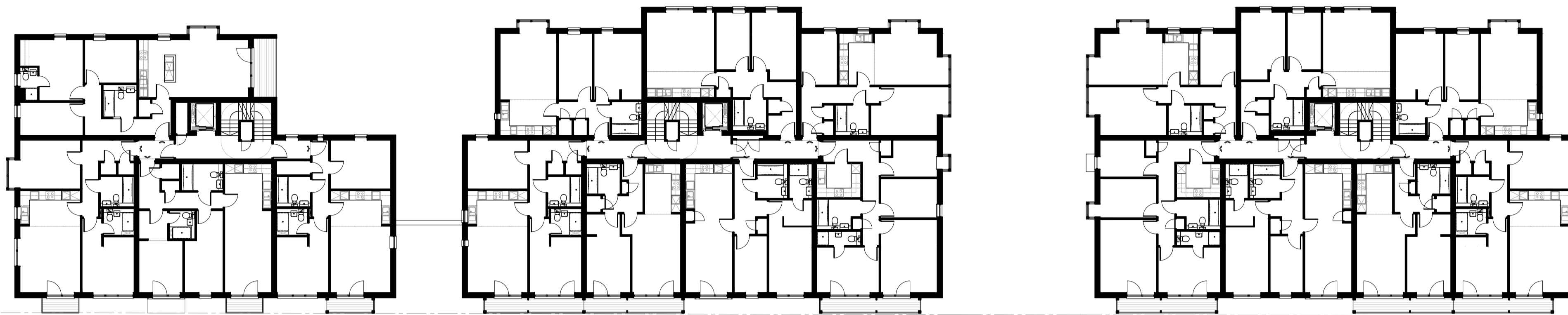
PROPOSED SECOND FLOOR PLAN SCALE 1:200 @A1